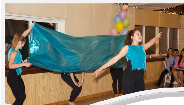
Hemet High School Dance Team

For more Bosses' Night pictures please visit: http://www.rcaeop.org/bosses-night.html