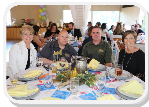
Hemet Unified School District