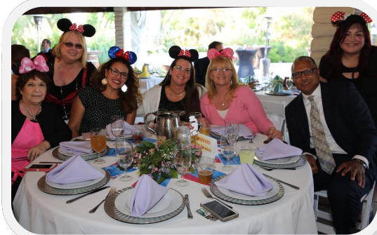
Perris Union High School District Educational Services Staff