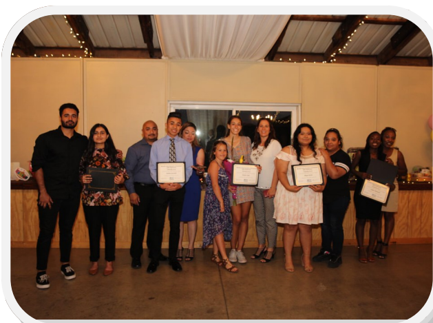
Congratulations to the scholarship winners and their families!